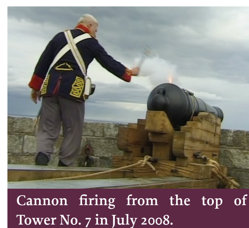
Cannon firing from the top of Tower No. 7 in July 2008.

The Fortification is a museum and not a dwelling. It is located on Tara Hill at the junction of Killiney Hill Road and Killiney Avenue, 1/2 mile south of Killiney village. All are welcome so call 087 2885522 or email Niall.tower@gmail.com or Google, niall's tower 7 to view the inauguration ceremony.