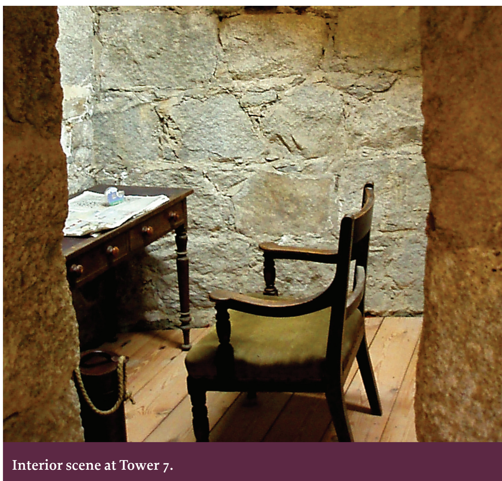
Interior scene at Tower 7.

I bought the property in 1996 when it was in a completely ruinous state. I was unprepared for the long challenge ahead, which took thoughtful research from 1997 to date and restoration and rebuilding works from 2003 to 2008. The restoration work required forensic attention to detail including any bits of wood and stone lying around or buried beneath rubble dumped there by the owners of the Tower from 1910 to 1987. That was in addition to their demolition of the Gunners cottage and several other buildings. What a mess to resurrect the story from!